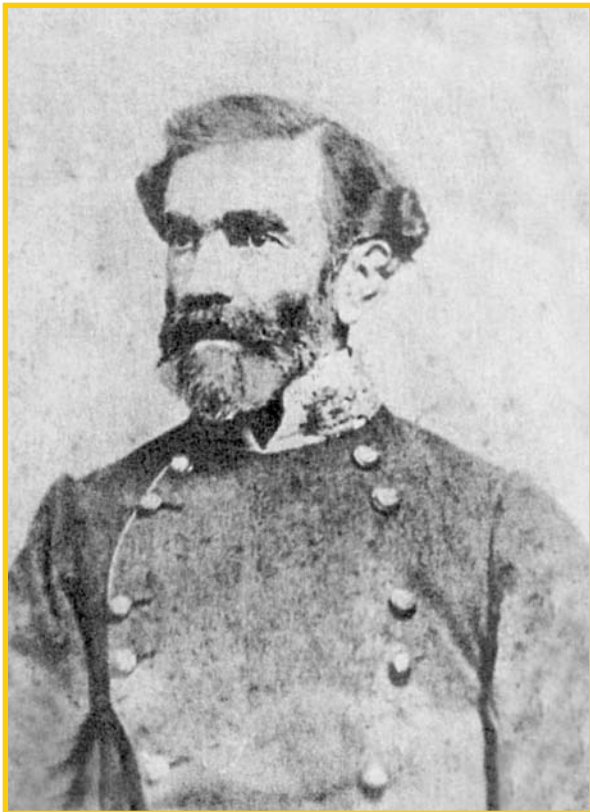
Braxton Bragg, whom Longstreet sought to have relieved of his command